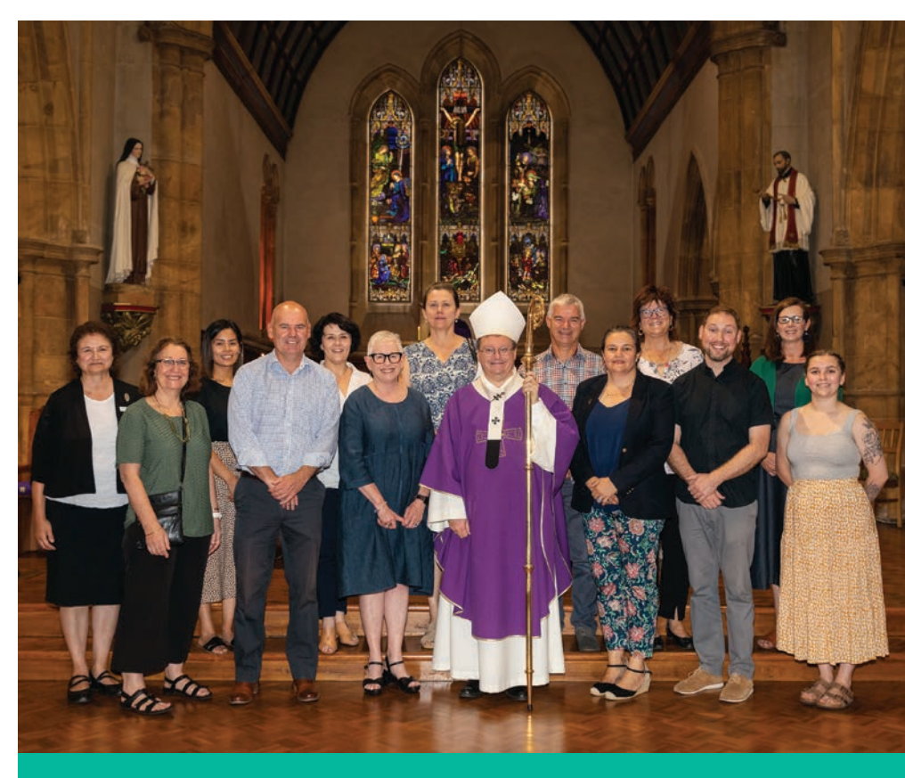
CATECHISTS' COMMISSIONING MASS

Training for parish personnel in leading Liturgy of the Word with Children within various parish and school communities was facilitated, and several workshops and trainings were held for sacramental teams, Catechist Enrichment Days and those involved in Liturgy of the Word with Children.